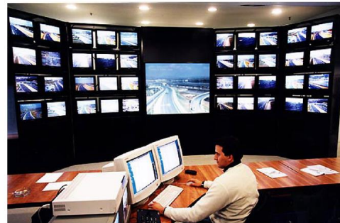
The Attiki Odos Traffic Management Operations Center

The Attiki Odos has more than 200 freestanding pillars that line the highway and house control panels for the road lighting. There are also 7 toll administration buildings, 41 power distribution substations, along with 11 pumping and drilling stations that bring underground water from the surrounding area to the surface for irrigation of the plant and tree life. All of these are controlled by a single unified Opto 22-based automation and supervisory control system located at a centralized traffic management operations center. Vagelatos says that a mixture of more than 90 Opto 22 SNAP-LCSX and SNAP-LCM4 controllers are being used to monitor and control the building and energy management systems at the toll buildings, power equipment at the substations, and all of the more than 340 irrigation valves and pumps that deliver water to arid stretches of highway.