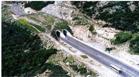
Egnatia Odos highway tunnels are fully monitored by Opto 22 SNAP Ethernet Systems

to the SNAP system's analog input modules, operators can get real-time data on the health of the air in the tunnels. The Opto 22 systems also control the ventilation systems, which help maintain general air quality and extract smoke in the event of a fire.