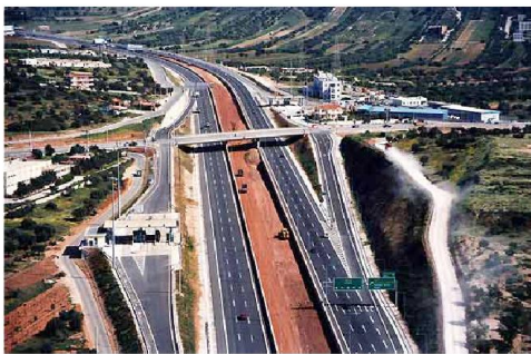
A stretch of the Attiki Odos highway

Specifically, the critical GOCC building and energy management systems being monitored and controlled by the Opto 22 hardware are medium & low voltage electrical distribution boards and components of the telephone data network. Also included is the Olympic Games' "ATHENS2004" Test Integration Laboratory, used for simulation of all IT network structures of the 2004 Olympic games. Sub-systems for this include air conditioning, power and low voltage wiring, and network wiring—a total of more than 3,000 I/O points.