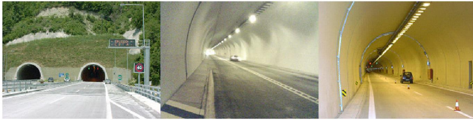
Attiki Odos highway tunnels

plus the fact that there are so many remote locations and diverse electro-mechanical systems involved, is yet another reason that ALGOSYSTEMS chose Opto 22 hardware. The company's control system components are ideal for deployment in a distributed architecture, and the company is always developing new products—like a line of high-density I/O modules that are likely to prove invaluable as the Attiki Odos project continues to expand."